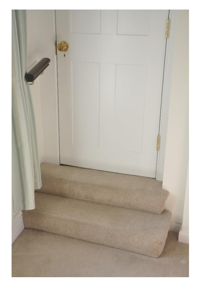
Photo 6 showing step up from Garden Suite bedroom to bathroom on left and further step (with handrail) to sitting room and kitchen area.