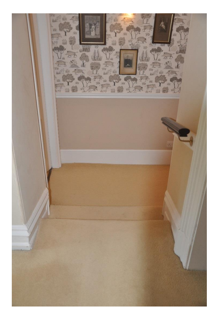
Photo 5 showing the two steps on the upstairs landing giving access to the Brooking Room and Willow Room.