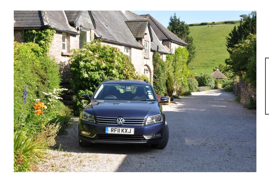
Photo 2 showing car parking area for the Garden Suite also showing at left, (background) the access via stone steps.

Photo 1 showing car parking area and access to the main front door (leading to the entrance hall, dining room/breakfast room, drawing room and Brooking Room and Willow Room bedrooms).