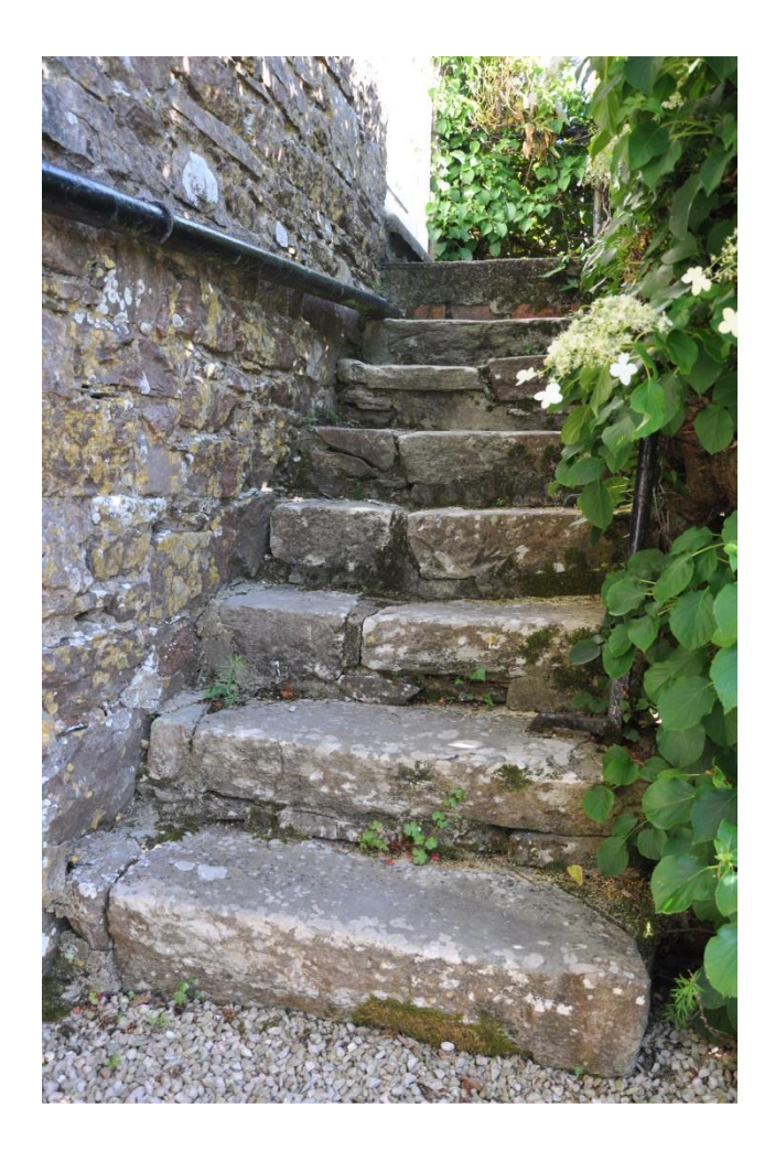
Photo 3 showing steps up to the Garden Suite front door with handrail at right.