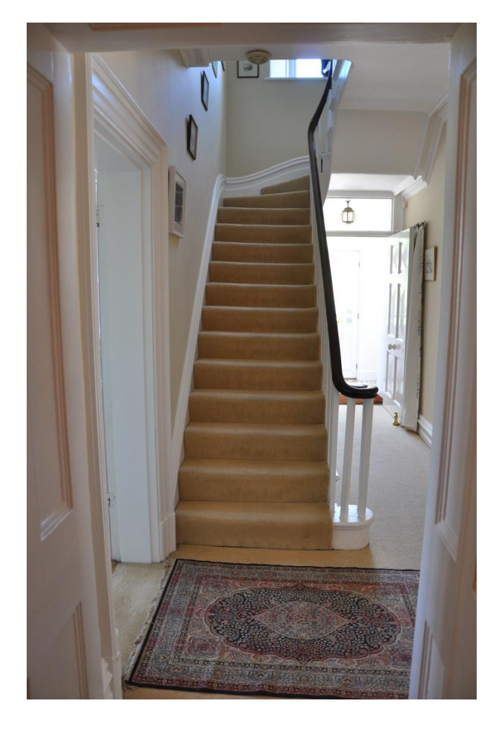
Photo 4 showing main entrance hall and staircase up to Brooking Room and Willow Room bedrooms.