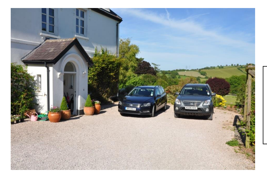
Photo 1 showing car parking area and access to the main front door (leading to the entrance hall, dining room/breakfast room, drawing room and Brooking Room and Willow Room bedrooms).